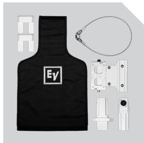
EVOLVE-WMK-NW Wall-mount kit, NL4, white F.01U.392.644