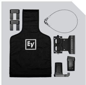
EVOLVE-WMK-PB Wall-mount kit, Phoenix, black F.01U.392.641