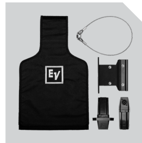
EVOLVE-TM-B Truss-mount bracket, black F.01U.395.777