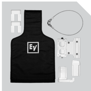
EVOLVE-WMK-PW Wall-mount kit, Phoenix, white F.01U.392.642