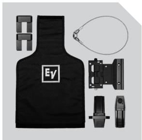
EVOLVE-WMK-NB Wall-mount kit, NL4, black F.01U.392.643